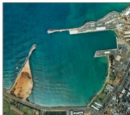
Air Safety Hawaii Photo

Department of Transportation Harbors Division 103 Ala Luina Street Kahului, Hawai'i 96732 Telephone: (808) 873-3350