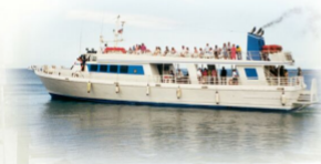
A ferry vessel leaving Kaunakakai Harbor.