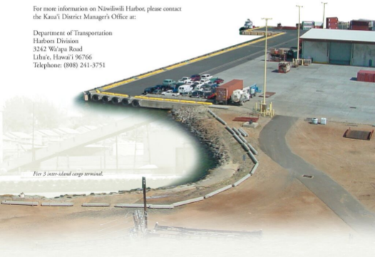
Pier 3 inter-island cargo terminal.