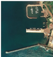
Air Survey Hawaii Photo

Department of Transportation Harbors Division 4300 Waialo Road 'Eke'e, Hawai'i 96705 Telephone: (808) 335-2121