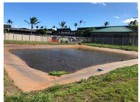
Evaporation Pond at OGG Washrack