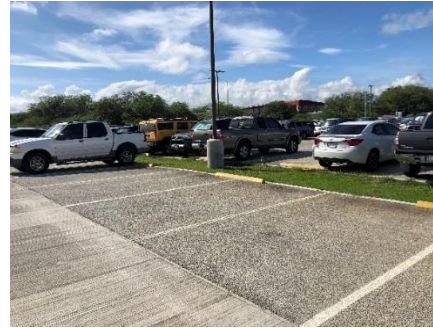
Permeable pavement and grass swale at HNL Elliott Street parking lot

The purpose of permanent/post-construction best management practices (PBMPs) is to retain stormwater on-site, control the source of potential pollutants, and/or treat stormwater that enters the MS4.