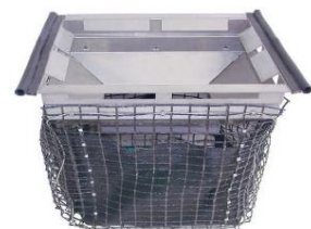
Drain inlet insert