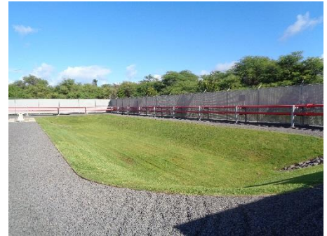
Retention Basin at HFFC OGG

PBMP inspection records should be readily available as DOTA will verify them during tenant stormwater inspections of your facility. Maintenance records are considered inspection records for OWS, HDS/CDS, and drain inlet inserts.