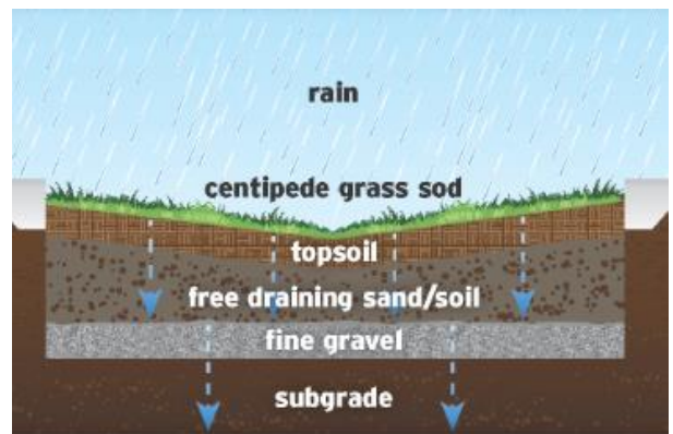
Cross section of a bioretention/grass swale

PBMP maintenance is site-specific and dependent on the amount and quality of runoff delivered to the PBMP. Routine maintenance to remove sediment, trash, debris, and/or overgrown vegetation will help avoid costly rehabilitative maintenance to repair damages that may occur when the PBMPs are not maintained on a regular basis.