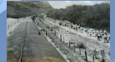
Train in Nanakuli