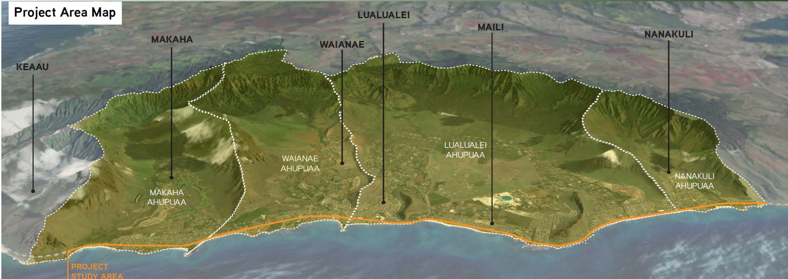
Project Area Map

Virtual 'Āina Meetings Round 2 Q&A Sessions: May 6 (Wai'anae/Makaha) & May 7 (Nānākuli/Maili), 2020