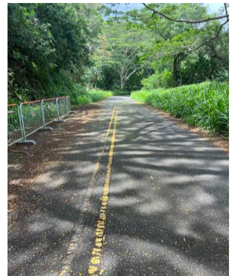
Site Visit: Kolekole Pass (Army) - May 6, 2024