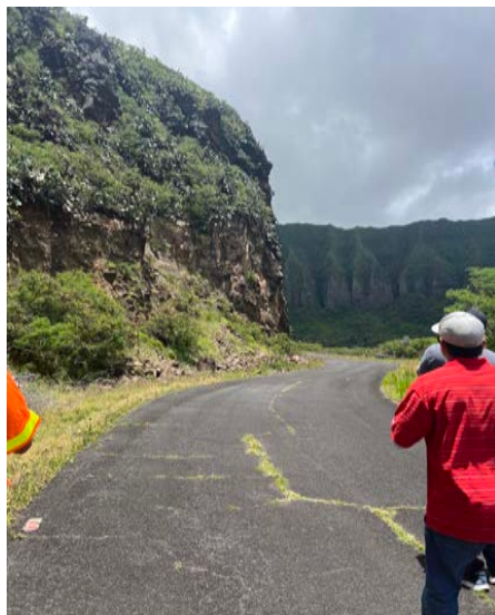
Site Visit: Rockslide - May 6, 2024