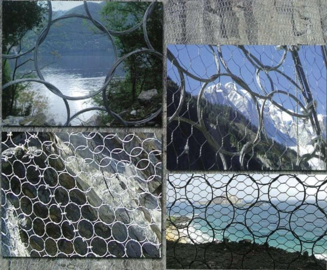
Examples of ring nets